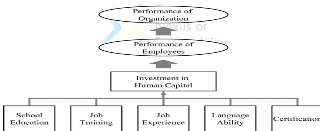
Fig 1: Human Capital Theory of Becker 1992

According to the human capital hypothesis, training and education are investments that raise a person's earning potential and productivity, which promotes economic progress and the welfare of society. It emphasizes how important education is to creating a competent labour force and encouraging creativity, making it a vital component of both personal and societal advancement (Becker, 1992). Over the course of their careers, those with greater education and skill levels typically make more money. Education increases one's employability and opens up more favourable employment prospects. People from underprivileged backgrounds can raise their socioeconomic standing with education. Education promotes communication, problem-solving, and critical thinking abilities, all of which support general personal development. Social cohesion, civic participation, and informed citizenship are all enhanced by education. Economic growth, productivity, and creativity are all fuelled by a workforce with a high level of education.